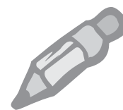
Figure 36. Example from Cedar Summit Farm—Worksheet 3.5: Prioritizing Goals