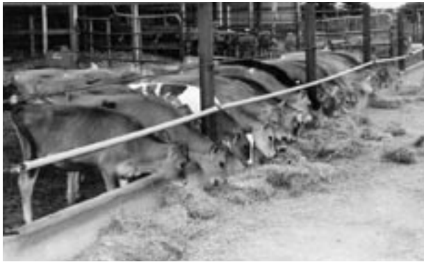
Group pens may be created by removing partitions between individual pens after the heifers are weaned.