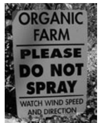
Organic dairy operations must make efforts, like posting their land, to prevent contamination by prohibited substances.

There are a variety of reasons that producers choose to become organic producers. In many cases, the decision to farm organically matches the stewardship and animal husbandry values of the farm. Many producers are also attracted by the price stability of organic milk and by price premiums (see Figure 2).