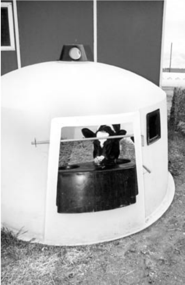
Some operations segregate calves in hutches like these.

that are carrying heavy debt loads do go out of business; others sometimes choose to stop outsourcing heifer production until the milk market improves. When these things happen, custom growers can lose a significant portion of their business.