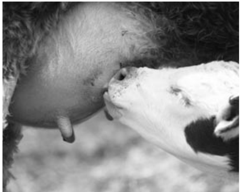
Calves are usually weaned when they are between four and eight weeks old.

Many contract growers provide their own transportation, picking up and delivering heifers as needed. Growers sometimes specialize in a specific phase of heifer production and may work with other contract growers as a network. For example, a custom grower may take heifers from day three after birth to six months of age. Others keep them from six months through breeding. Still others may specialize in the period from breeding until return to the dairy where the cow will eventually be milked.