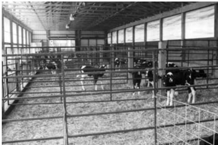
In this calf barn, the animals move from pen to pen as they grow.

Some larger dairies want the animals from their herds to spend at least part of their time out on pasture before they return to the farm. Pastured animals are perceived to be healthier because they get more exercise and develop a larger rumen. The end benefit of pasturing is higher milk production (Fanatico, 2000). When the heifers return and move into a free stall facility, they're better able to produce milk. If pasture is used, permanent and temporary fencing and water will be needed.