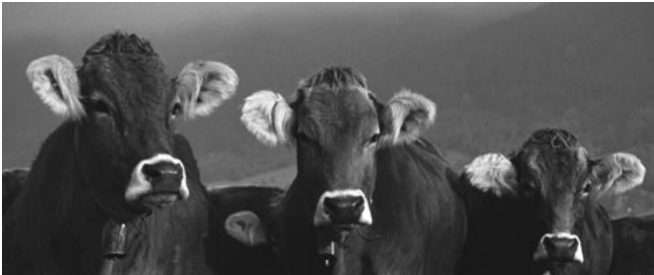
Many organic producers favor colored breeds.

Breeding practices vary within the organic production system. While many dairies use artificial insemination, some use bulls. Some herds use Holsteins. Many organic producers who use managed grazing have adopted grazing genetics, trending toward Jerseys, Normande, Scandinavian Red, Ayrshires, Brown Swiss, and a number of crossbreeds recognized as efficient grazers. These breeds also produce milk with a high fat and protein content, and contribute characteristics like longevity and fertility to their offspring.