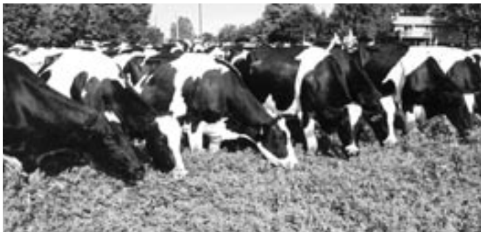
Federal organic rules require that ruminants have access to pasture.

The National Organic Standards Board defined organic agriculture as “an ecological production management system that promotes and enhances biodiversity, biological cycles, and soil biological activity.” The definition further specifies minimal use of off-farm inputs, and emphasizes on-farm ecological harmony. The practice is intended to be site specific and aims to conserve biological diversity within the farm as a whole (NCAT, 2004).