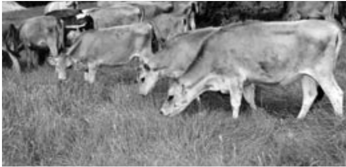
On many custom heifer raising operations, like this one in Minnesota, heifers spend a good deal of time on pasture.

Most heifer growers are responsible for breeding. Heifers are typically bred between 13 and 15 months of age. The grower follows contract specifications for genetics, and contracts may also specify the number of attempts at artificial insemination. Many growers use a clean-up bull to ensure that all heifers become pregnant. The springing heifers are returned to the dairy three to four weeks before calving to allow them to get accustomed to their new setting and feeds. This time also permits the dairy to boost protein and energy in the ration to prepare the animal for milking and calving.